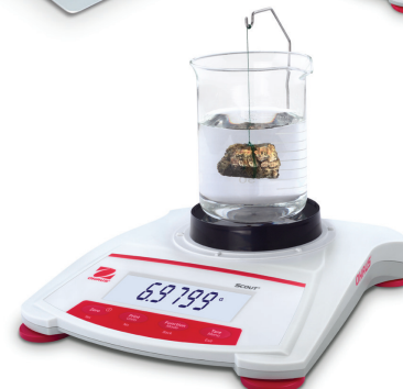
Scout shown with optional Density Determination Kit

It's all about accuracy and efficiency with the OHAUS Scout balance. Stabilization time as fast as 1 second combined with high resolution deliver extremely precise and repeatable weighing results that you can count on time and time again. This makes the Scout ideal for routine experiments and other weighing applications in your classroom.